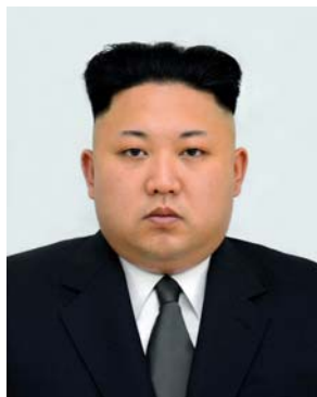
Kim Jong-un, the dictator of North Korea.

So controlled are the North Korean people that they have no access to the Internet or media outside state sponsored propaganda, and the basic freedoms of movement and expression and the right to assembly are nonexistent. To protect the power of the regime, the people are starved in order to fund the massive military engine stationed along the United States-protected South Korean border.